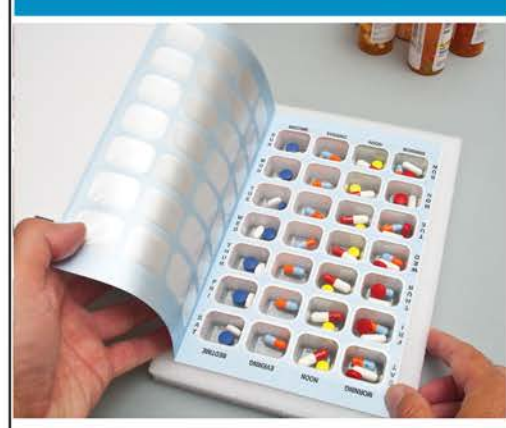
Once all of your medications are loaded into the card, fold the foil flap over to seal the card.