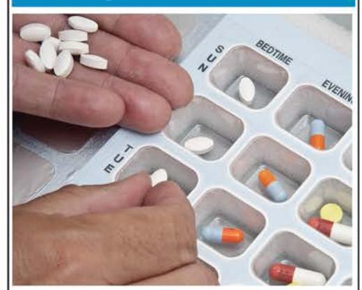
Pill #6 you take each day before you go to bed. Place one pill in each of the bedtime blisters, sunday thru saturday.