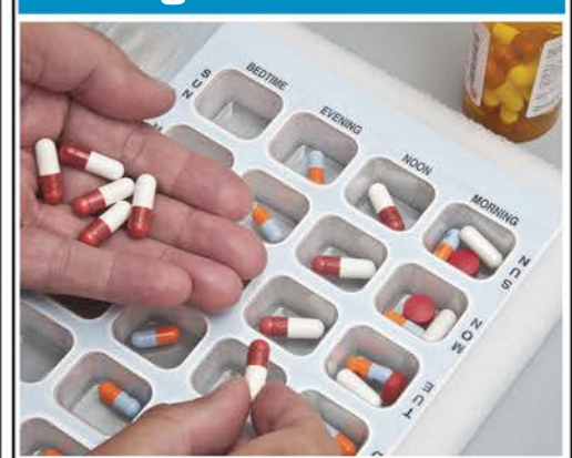
Next, you take pill # 4 at noon each day. Place one pill in each of the noon blisters, sunday thru saturday.